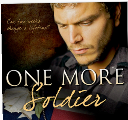
A GREAT REVIEW FOR ONE MORE SOLDIER