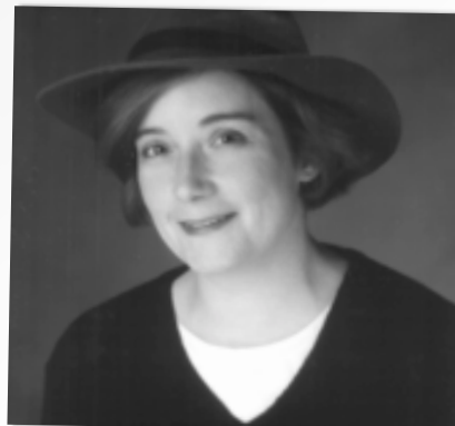
LYNN FLEWELLING INTERVIEWED ME ON HER BLOG